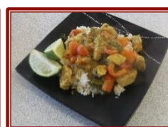
Sinead C. (10B)