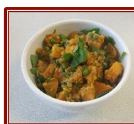
Evie A. (10K)

Year 10 GCSE Food and Nutrition pupils were given a task of creating a dish to meet the needs of a particular life stage e.g. toddlers, school children, teenagers, adults or the elderly. A selection of the best dishes are shown below - they look fabulous!