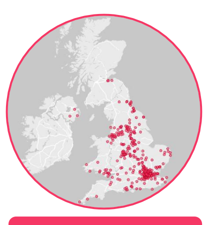
Scholars Programme placements in